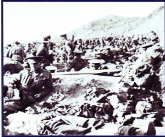
25 April 1915 – ANZAC Cove